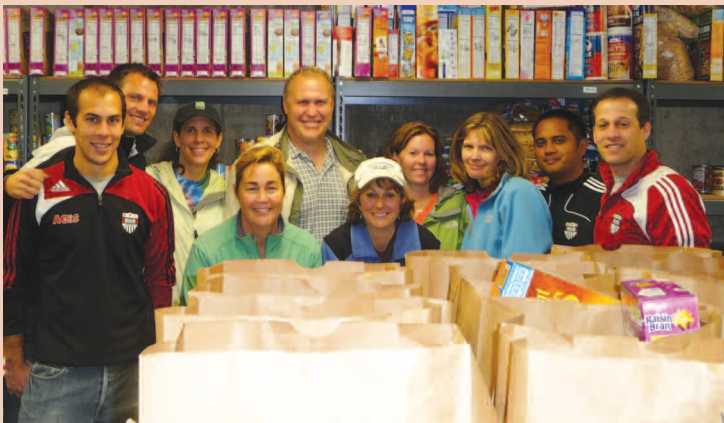
Arlington Aces and volunteers with their Thanksgiving donations.

Thanks to the Arlington Aces for their generous donation of Thanksgiving baskets and gift cards. Because of this difficult economy, the number of families asking for assistance has almost doubled so, needless to say, the baskets were appreciated and well received.