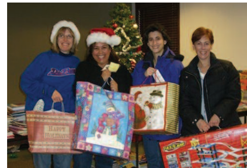
Arlington Heights Junior Women's Club Members

The annual holiday partnership between the Arlington Heights Junior Woman's Club and Wheeling Township was again a huge success. One hundred and fifty children from families in need received a generous outpouring of gifts from local residents.